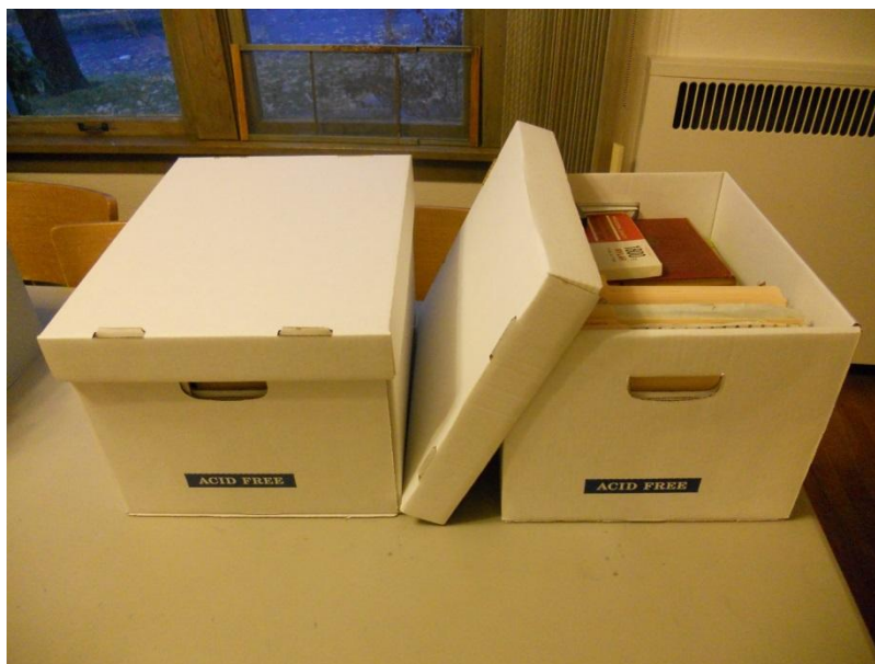
The newly completed Robinson Collection from the LCHS backlog organized in new acid-free boxes.